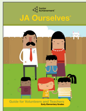
Guide for Volunteers and Teachers