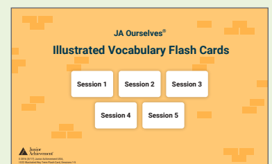
Interactive Flash Cards