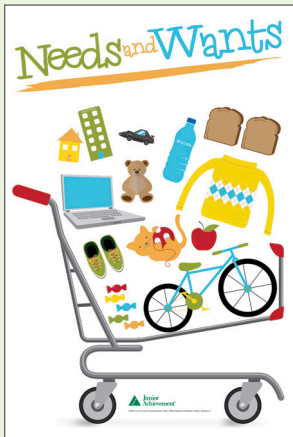
Needs and Wants Poster