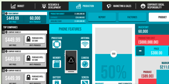
Sample Production Screen in JA Titan Simulation